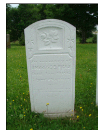
Ambrose E. Hicks